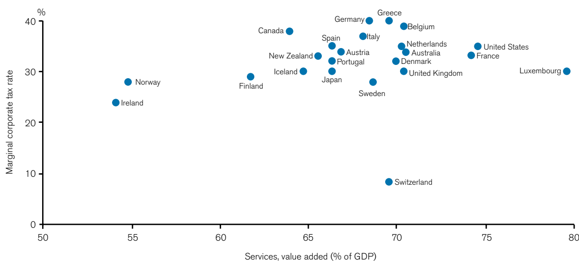
Figure 3: The relationship between the size of the services sector and corporate tax rates in 2000