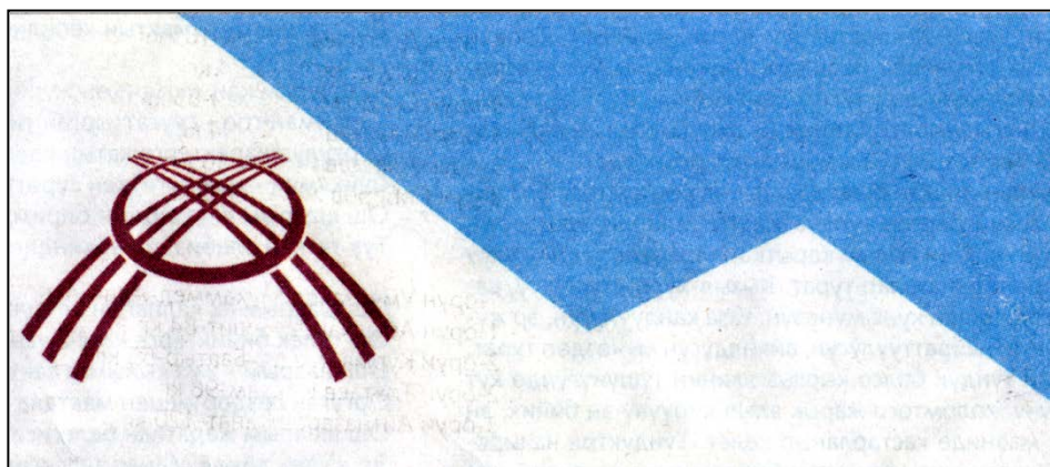
Figure 4. The new flag of Osh city

More tangibly, the mayor initiated the construction of a number of monuments around the city. To mark the 'year of strengthening the relations, concordance and friendship between ethnic groups in the city of Osh', the so-called 'Bell of Peace', made in the Russian city Novosibirsk, was installed. 87 On the first anniversary of the 2010 violence, Myrzakmatov unveiled a monument called 'The mothers' tears'. In a speech, he said that the slogan 'Kyrgyzstan is my homeland' ( Kyrgyzstan – menin mekenim ) is sacred, symbolizing the unity of the citizenry and the apex of the common national idea. 88