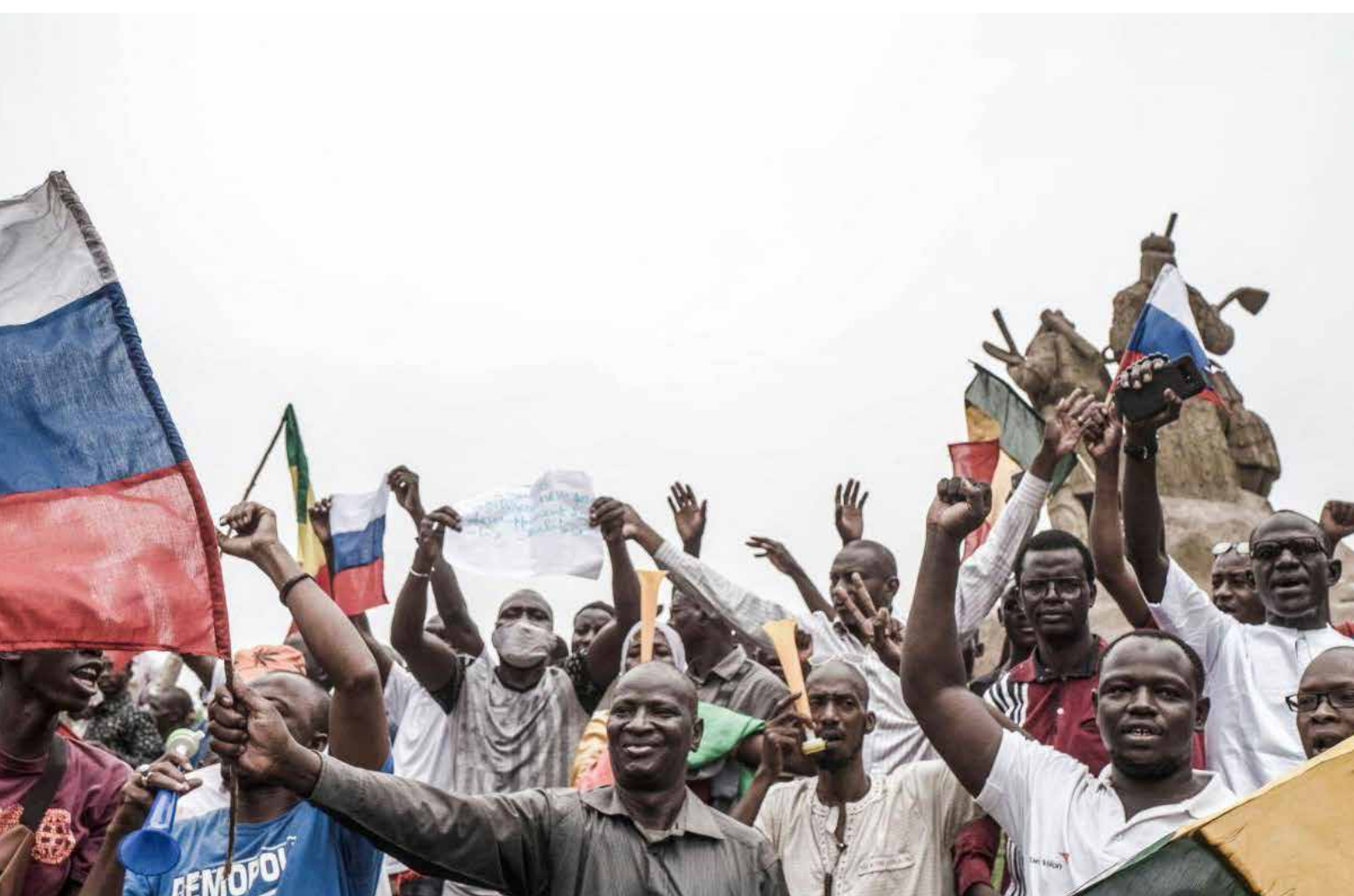
Image: Russian and Malian flags are waved by protesters in Bamako during a demonstration against French influence in the country.

Cyberspace presents new challenges for international governance and constitutional principles. An Africa Programme side-event at the 10th High-Level Tana Forum on Security in Bahir Dar explored Africa's priorities in the ongoing UN Cybercrime Convention negotiations, examining the roles and responsibilities of different technology actors and evolutions in digital constitutionalism and multilateralism in Africa. As part of a project on South-South cooperation on technology governance, the Africa Programme hosted a webinar in February on the intersection of technology and the global knowledge economy and potential collaborative strategies among actors in the 'Global South.'