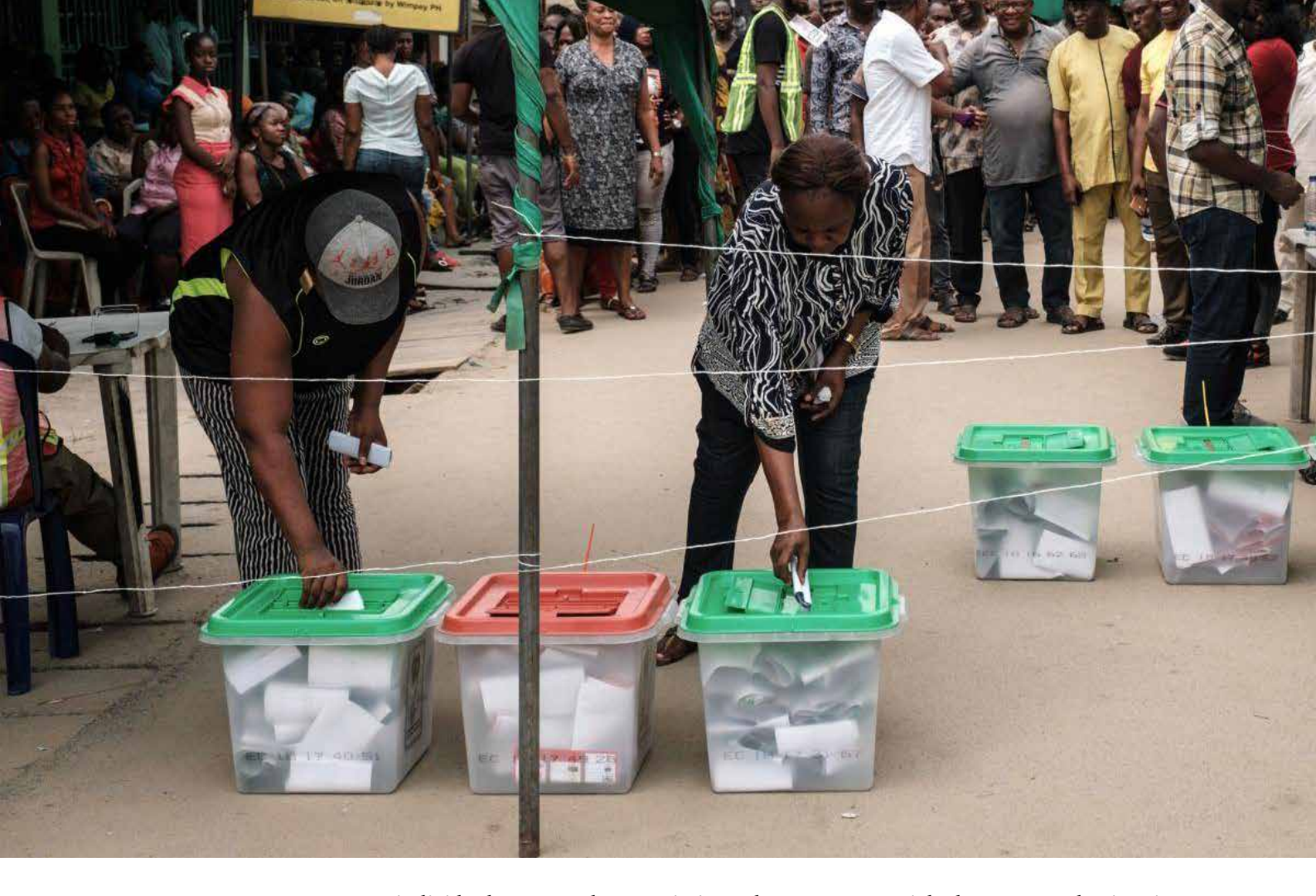
Image: People cast their ballots in the presidential and parliamentary elections at a polling station in Port Harcourt, southern Nigeria, on 23 February 2019.

individual voters seek to maximize a short-term material advantage at election time, and offers suggestions for effective interventions to increase voter awareness of the negative long-term effects of vote-trading.