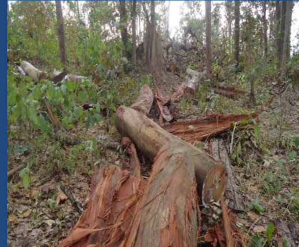
Logging in Community Managed Forest