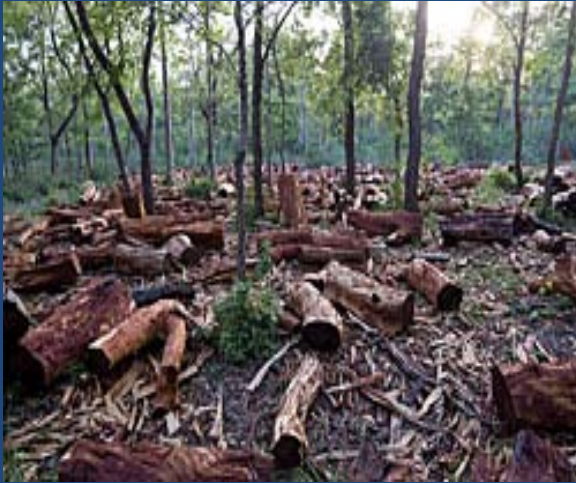
Logging in Terai CF