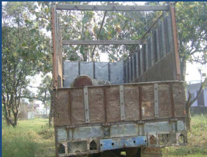
Logging in Govt. Managed Forest