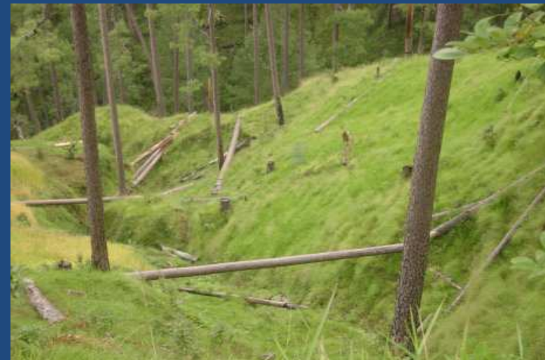
Logging in Mid Hills